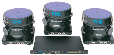
STACIS® Active Piezoelectric Vibration Cancellation System

To improve performance, TMC engineers recommended a STACIS® active piezoelectric vibration cancellation system to support the entire Nanoform 250, including the embedded MaxDamp air isolators. STACIS cancels vibration down to extremely low frequencies, those often related to difficult-to-measure transient or random vibration, such as foot traffic or nearby machinery. The STACIS platform was initially tested beneath the Nanoform 250 Ultra at Precitech. Interestingly, test results for this application produced improved performance, even though the Precitech floor is extremely quiet.