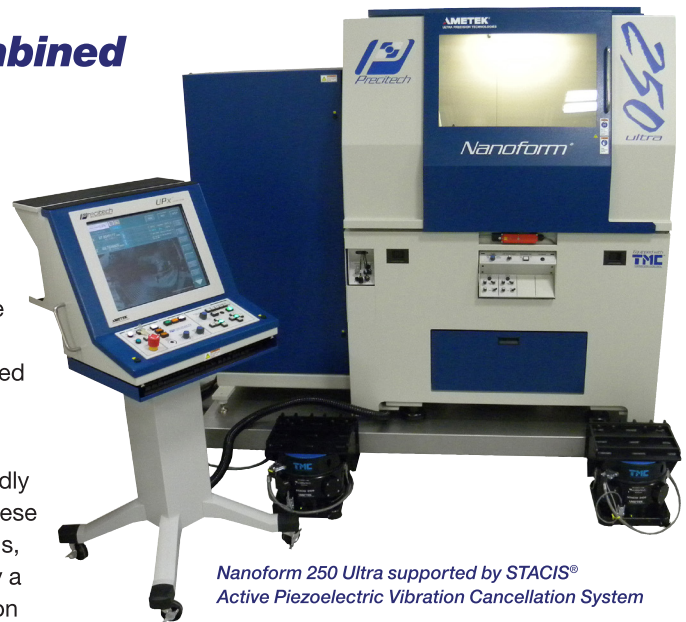
Nanoform 250 Ultra supported by STACIS® Active Piezoelectric Vibration Cancellation System