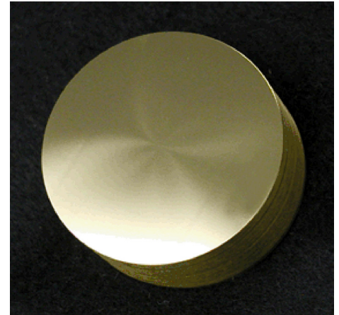
Light management array, 40 mm OD brass disk 620,000 lenses Lens pitch 45 \mu\text{m} , Lens form 250 \mu\text{m} R sphere.